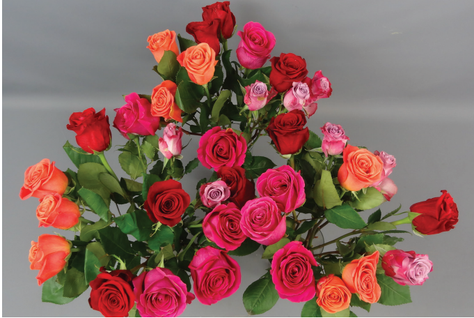
Control (No Wrap) 20°C