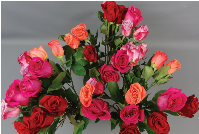
Control (No Wrap) 30°C