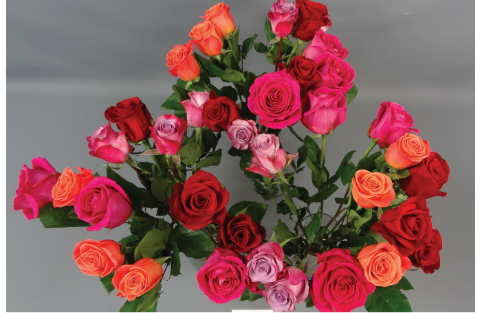
With FloraLife® Bouquet Wrap 20°C