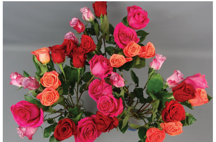
With FloraLife® Bouquet Wrap 30°C