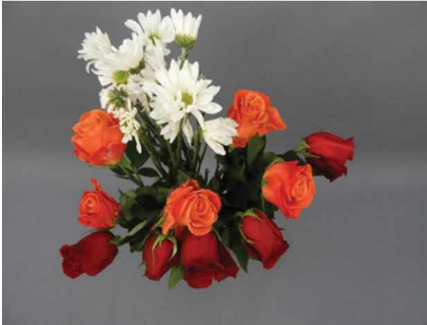
Control (No Wrap)