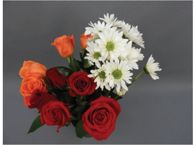
With FloraLife® Bouquet Wrap

For 87 years and counting, the FloraLife® team has dedicated itself to the science behind caring for fresh-cut flowers. Pioneers in floral care-and-handling innovations, our research and development experts test and analyze flowers and products on a regular basis, resulting in high quality products you can trust.