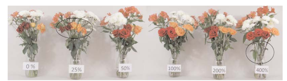
Flower Food Dosage Photo Taken on Day 7 of the Vase Life

The photo above shows the appearance of the flowers on day 7 of vase life. Flowers wilted early at dosage rates less than 100 percent recommended rate. At higher than recommended doses the flower stems lost leaves due to phytotoxic damage.