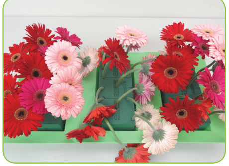
Day 3: OASIS® Floral Foam Maxlife in water with Facination (pink), Indian Red (red), Express (hot pink) Gerberas