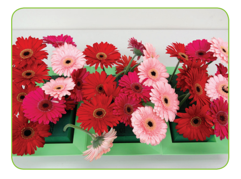
Day 3: OASIS® Floral Foam Maxlife in Floralife® Floral Foam Food with Facination (pink), Indian Red (red), Express (hot pink) Gerberas

Over a 5-day period, approximately 425 ml of water per foam brick was lost due to surface evaporation. This translates into an approximate water loss of 20% over a 5-day period. OASIS® Floral Foam Maxlife increased water uptake of gerbera over time compared to OASIS® Floral Foam Advantage Plus, and uptake was further increased by soaking OASIS® Floral Foam Maxlife in Floralife® Floral Foam Food. Likewise, OASIS® Floral Foam Maxlife reduced the % of wilted flowers over time compared to OASIS® Floral Foam Advantage Plus, and this % was further decreased by soaking OASIS® Floral Foam Maxlife in Floralife® Floral Foam Food. Gerbera water loss (%) at day 5 was lowest in OASIS® Floral Foam Maxlife saturated in Floralife® Floral Foam Food treatments.