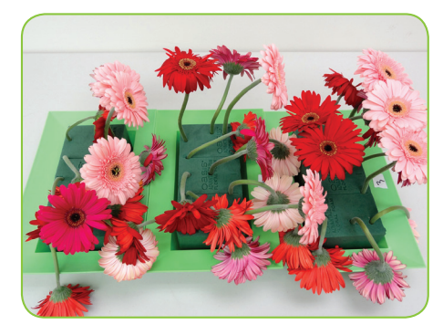
Day 3: OASIS® Floral Foam Advantage Plus in water with Facination (pink), Indian Red (red), Express (hot pink) Gerberas