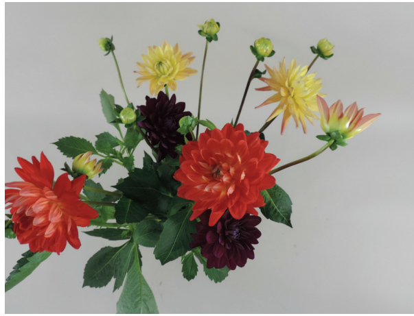
Finishing Touch ULTRA