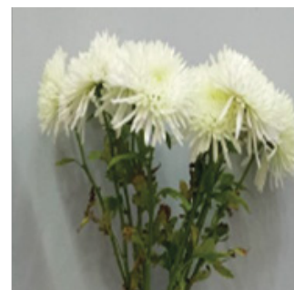
Figure 4: Chrysanthemum Treated (Day 7)