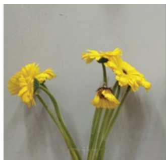
Figure 1: Gerbera Control (Day 7)

Fresh cut flowers shipped and stored with FloraLife® Transport Paper had an overall increase in vase life versus fresh flowers not shipped and stored with it.