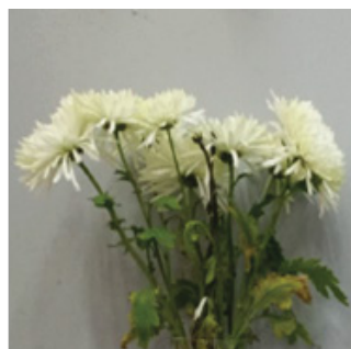
Figure 3: Chrysanthemum Control (Day 7)