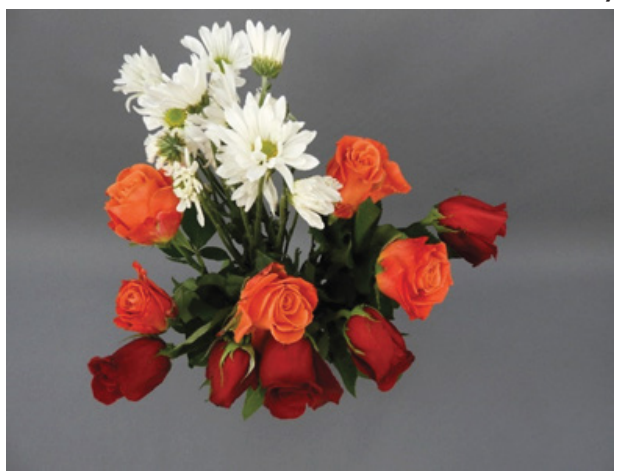
Control (No Wrap)