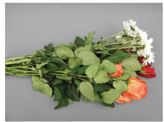
FloraLife® Bouquet Wrap