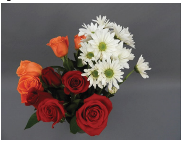
FloraLife® Bouquet Wrap