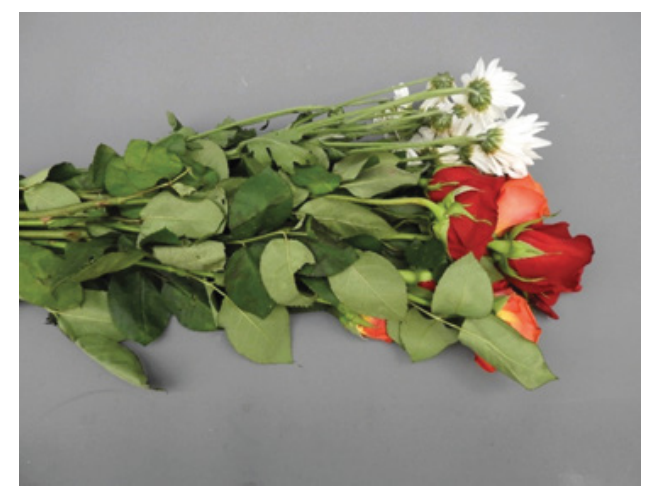
Control (No Wrap)