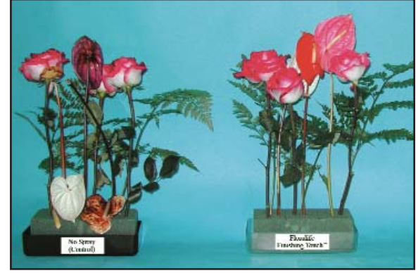
Control Floralife Finishing Touch™ Spray Time Period: 8 Days