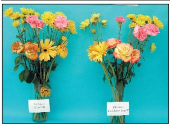
Control Floralife Finishing Touch™ Spray Time Period: 12 Days