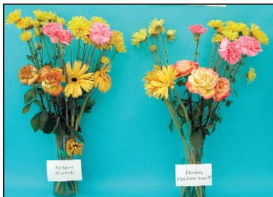
Control Floralife Finishing Touch™ Spray Time Period: 12 Days