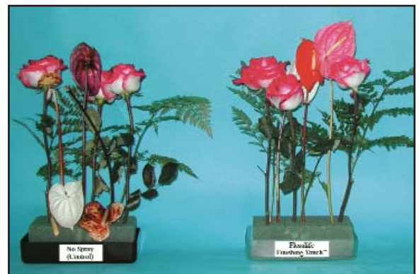
Control Floralife Finishing Touch™ Spray Time Period: 8 Days