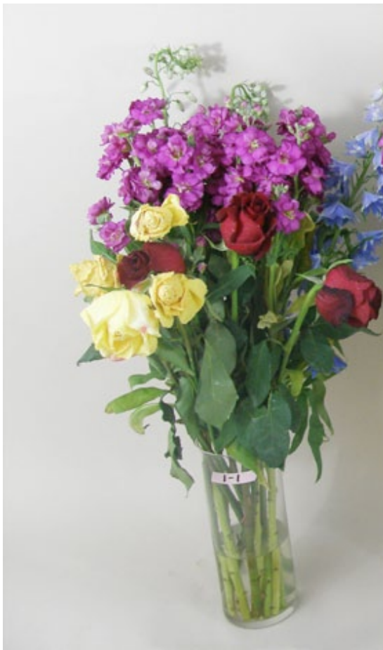
Control: Water → Floralife Crystal Clear® Flower Food