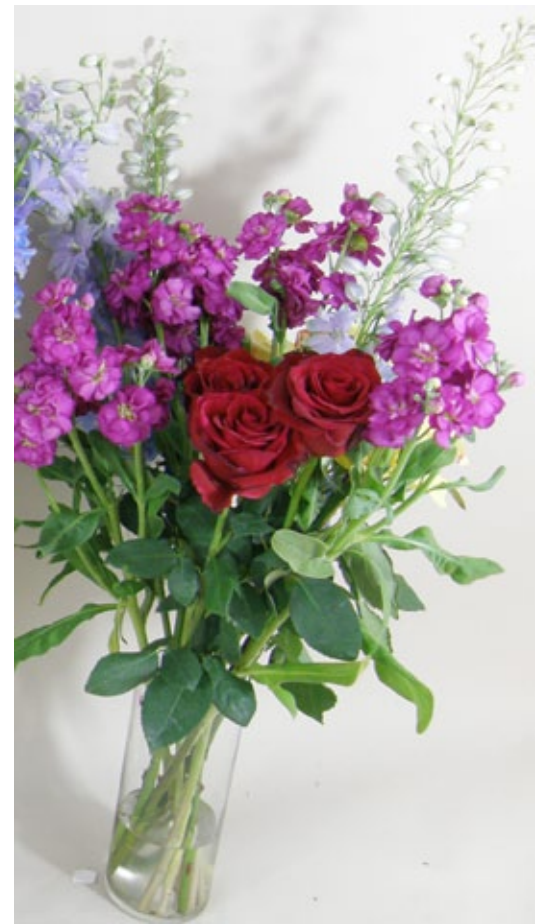
Treated: Floralife® eZ Dose® Storage Solution → Floralife Crystal Clear® Flower Food