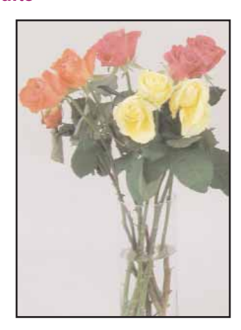
Water Storage Treatment + Floralife® Rose Flower Food