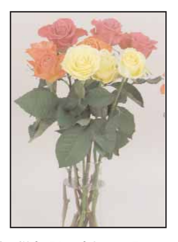
Floralife® eZ Dose® Storage Treatment + Floralife® Rose Flower Food