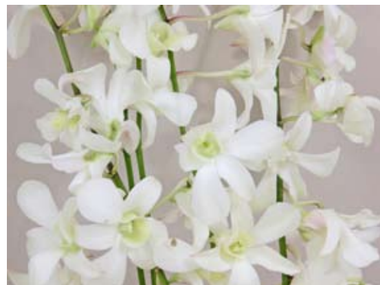
Florilife Crystal Clear® Flower Food